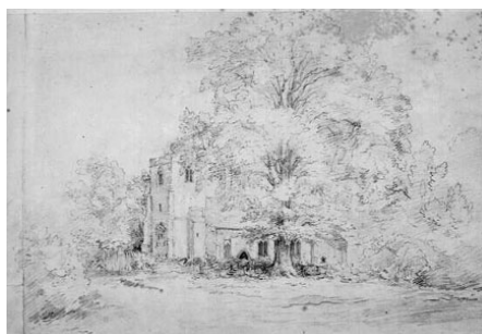
Hyam Church, Suffolk (John Constable)

A 'lost' early sketch by John Constable (1776 - 1837) and hundreds of original artworks and autographs by prominent 18th and 19th century artists have been discovered at the British Library. A 13-volume collection entitled The Life of J.M.W. Turner, R.A. features over 1,600 additions including portraits, views, autographs, engravings and original drawings including Turner correspondence and works by the artist's contemporaries, many previously unknown or considered 'lost'.