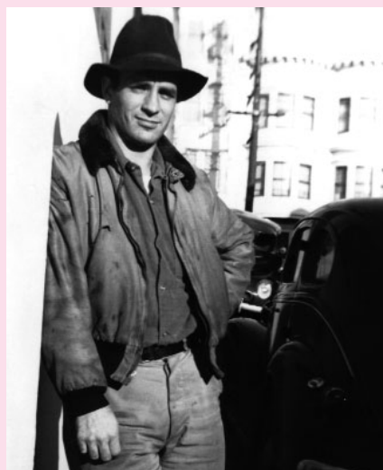
Jack Kerouac

'An Evening for Jack Kerouac', which was held in association with Penguin Books, comprised readings, music, film and conversation. Those taking part included Carolyn Cassady, wife of Kerouac's long-term associate and inspiration, Neal Cassady, and American composer and musician David Amram, who collaborated with Kerouac.