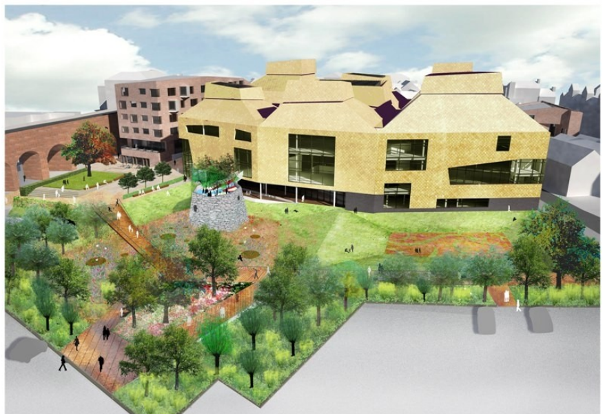
Artist's impression of how the Worcester Library and History Centre will look.

Further details of the project can be found on the website at: http://www.wlhc.org.uk/index.html