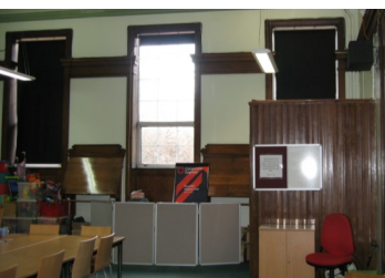
Ward End before

Late on in 2007 we heard we had been successful in applying for £1.4 million from the Big Lottery Fund's Community Libraries programme.