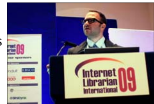
Cory Doctorow - 1st Keynote speaker

Trade Agreement a policy created to legislate secret copyright, Amazon and it's farcical eBook withdrawal incident, DRM (Digital Rights Management), intellectual property rights. Cory predicts that access will fall to one side and we will lose access to our information communities if we're not careful.