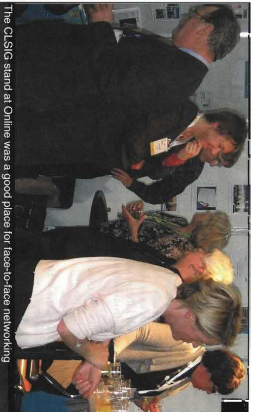
The CLSIG stand at Online was a good place for face-to-face networking

Gazette asked one of CILIP's special interest groups – CLSIG – what they get out of attending events such as Online Information.