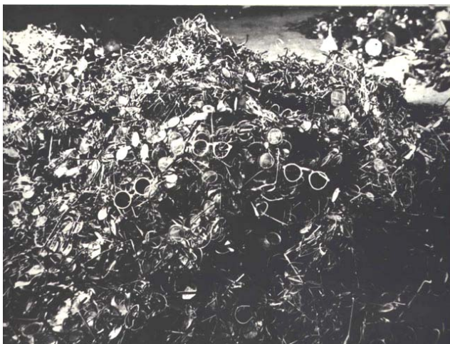
Glasses from Inmates at Auschwitz-Birkenau

Every year, a different theme is announced for Holocaust Memorial Day. This provides a focus for events and education in local and national commemorations. In 2007, the theme is "The Dignity of Difference". Previous years' themes are available online.