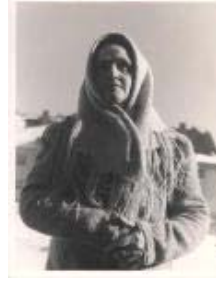
Woman at Displaced Persons camp Belsen 1947

Nazi concentration and extermination camp, Auschwitz-Birkenau, seen as a powerful symbol of the horrors of the Holocaust.