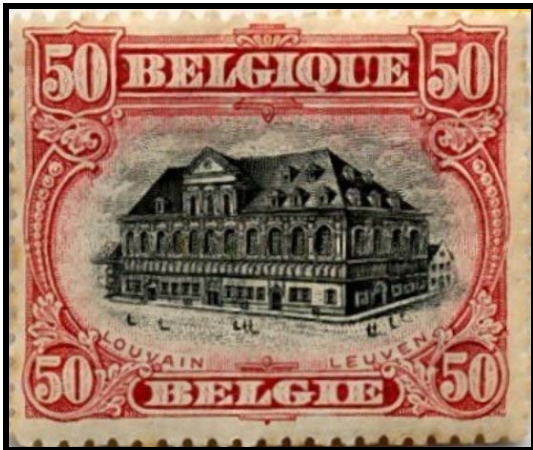
The Library of the Catholic University of Louvain