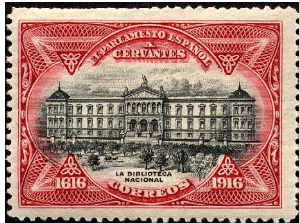
The National Library of Spain