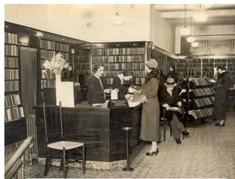
Blackpool store, ca. 1935

Junior staff received extensive training and sat Boots library exams that covered the Boots circulating system, service to subscribers and book knowledge.