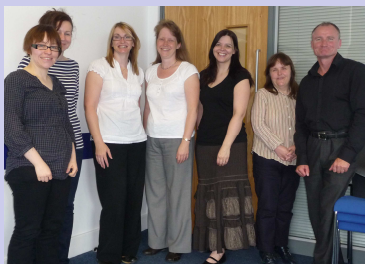
Meet the committee