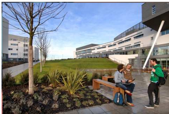
We visited Queen Margaret University Campus http://www.qmu.ac.uk/the_university/new_campus.htm

This offer is open to personal members of CILIP who live or work in the UC&RG (Northern) region or to University of Northumbria students on a library course, who would be first time attendees of the conference.