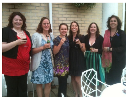
Lovely Lady Librarians at Gala Dinner